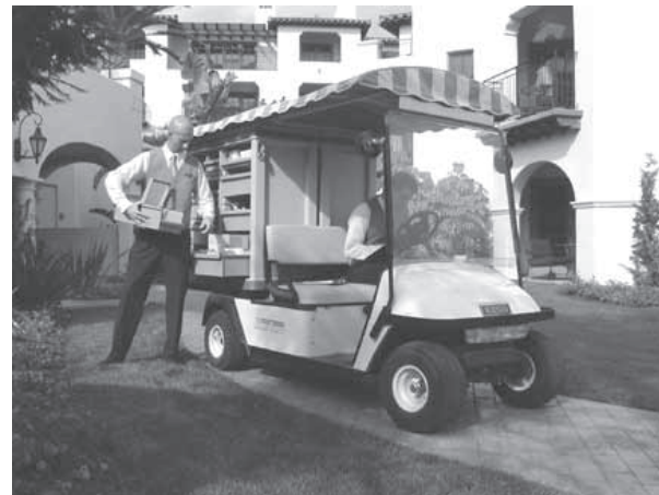
REFRESHMENT CENTER/MINIBAR RESTOCKING SETUP