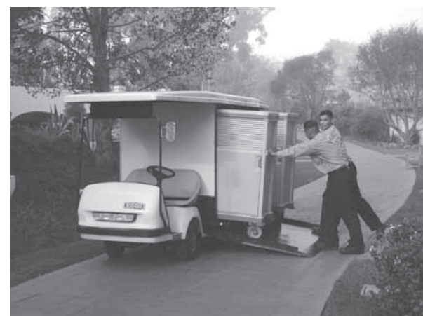
MOBILE DELIVERY - ROLL-ON/ROLL-OFF