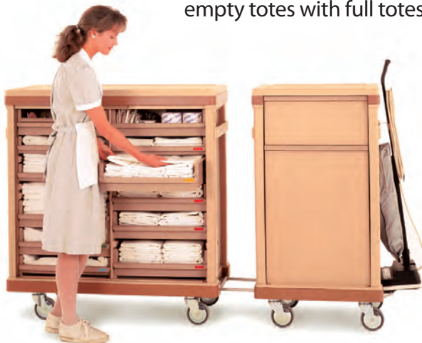
Mobile Supplier and Collector

Tote Carriers and Mobile Super Suppliers carry additional totes of linen and terry. They can be positioned for easy access in the guest floor service area, linen closet or room attendant section. Room attendants replenish their Mobiles by exchanging empty totes with full totes from the reserve linen units. (Shown on page 10)