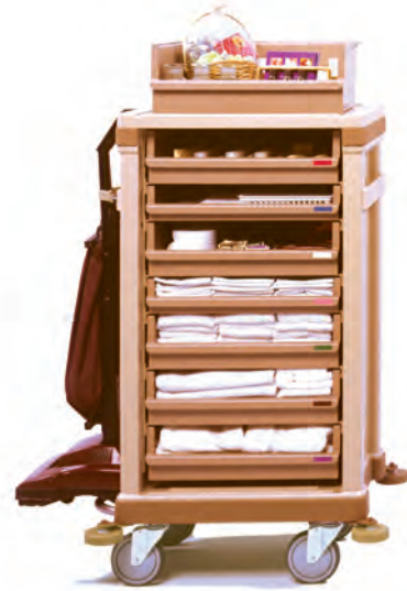
Room Attendant Mobile Handy Supplier