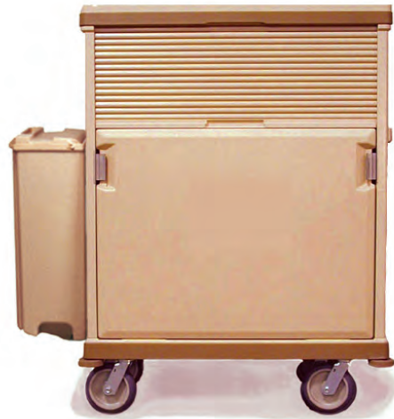
Houseman Mobile Super Collector