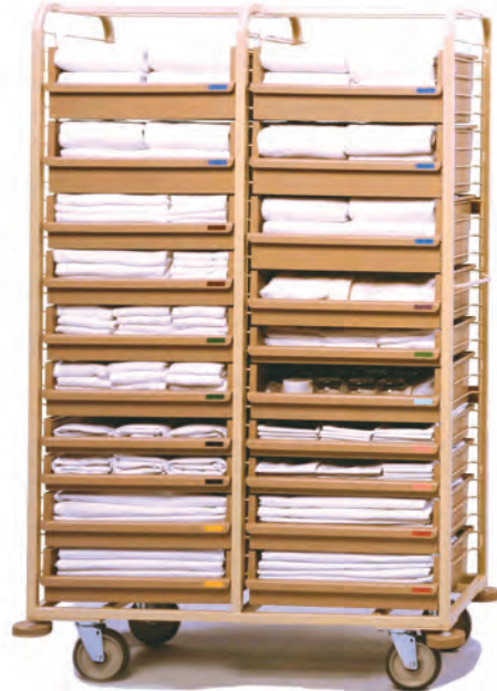
Reserve Linen Mobile Tote Carrier