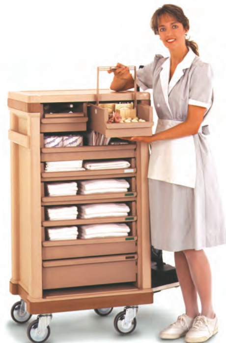
Mobile Handy Supplier