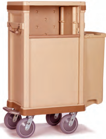
Room Attendant Mobile Collector with Rising Linen Base