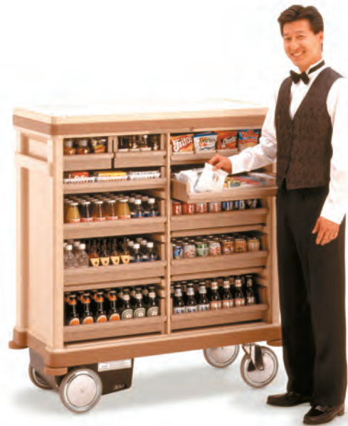
Minibar Mobile Supplier with Power Assist Option