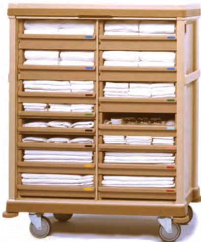
Reserve Linen Mobile Super Supplier