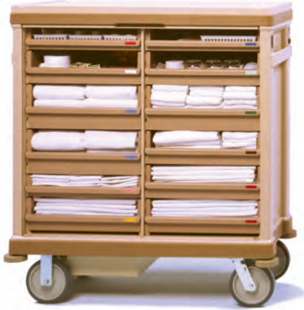
Room Attendant Mobile Supplier with Power Assist Option