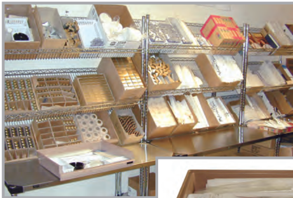
ProHost® Pick Station and Amenity Exchange Tote