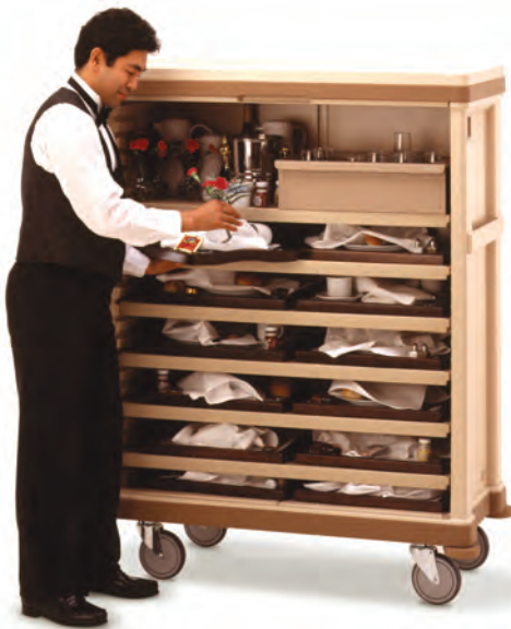
Room Service Tray Pick-up Mobile Super Supplier